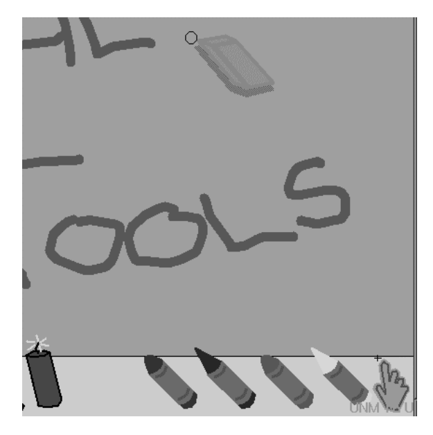
Figure 2: Some tools used in KidPad: An eraser, a bomb (for erasing an entire drawing), some crayons, and a hand (for moving objects).